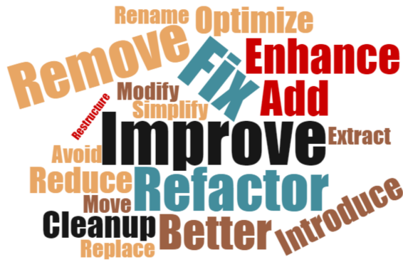
Figure 2: Top-10 Popular Patterns.

unit 7 , and (3) Moved data classes to a more suitable package , from Cdk 8 . A Closer inspection of these commit messages shows that developers intentionally apply refactoring to remove antipatterns that violate design principles and good programming practices.